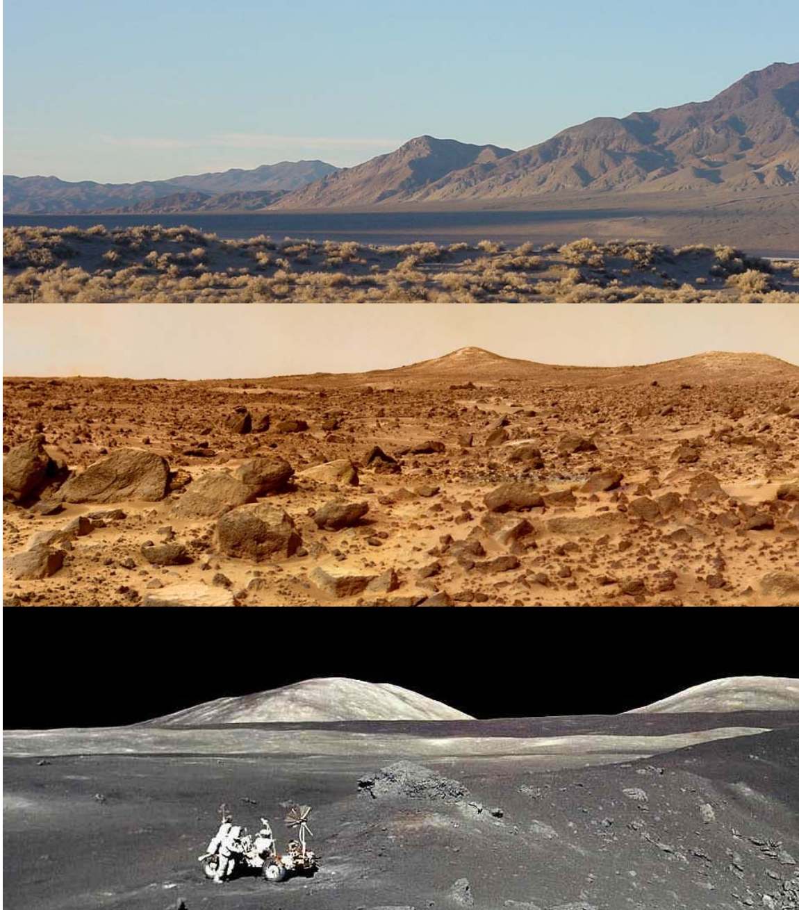
Figure 2. Real Estate in Nevada and on Mars and the Moon